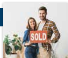
Seller HVAC Option

We made our coverage buildable because every home is different. Start with our basic plan, and then add on to it to complete your home warranty coverage.