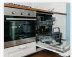
Discounts on new appliances

Limitations and exclusions apply. See contract for details.