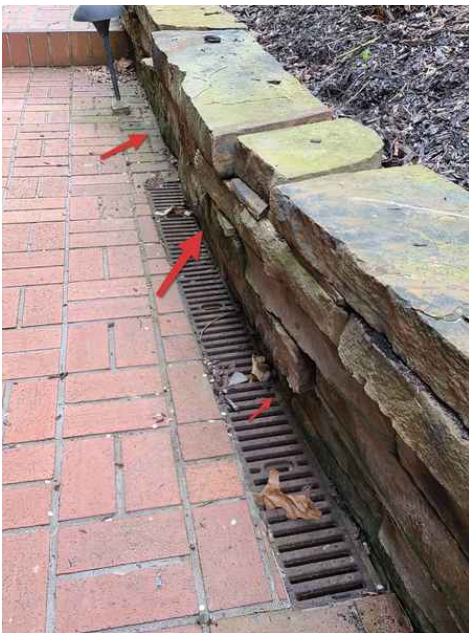
Right side of House