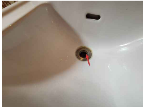
1st Floor Bathroom Sink