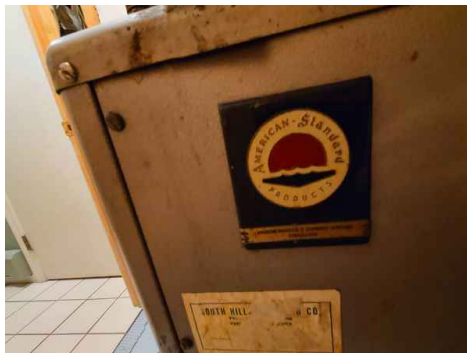
American Standard Boiler