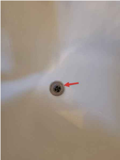
2nd Floor Bathroom Tub