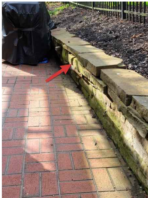
Right Side of House